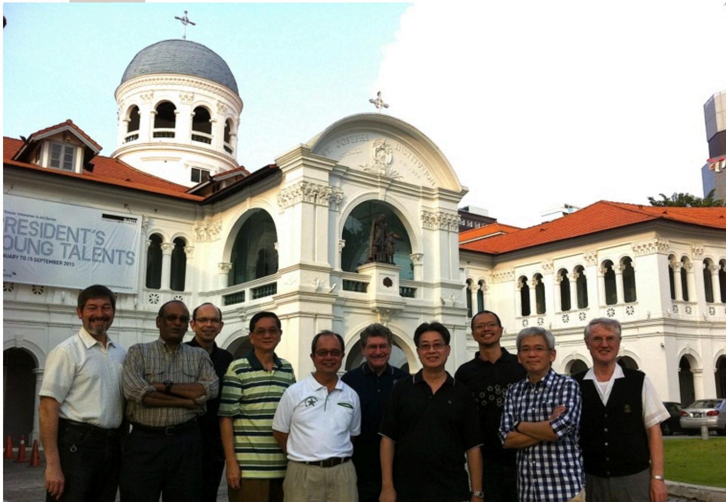
The LEAD Council at the Singapore Arts Museum, which was the former building and campus of St. Joseph's Institution.