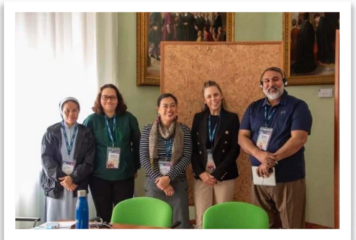
Left: Attendees of CIL; Right: Delegates from PARC