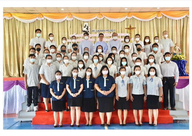
Thanksgiving Mass at La Salle Chanthaburi (Mandapitak)