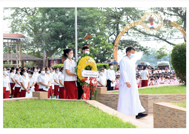
Commemorative ceremony at La Salle School, Nakhonsawan