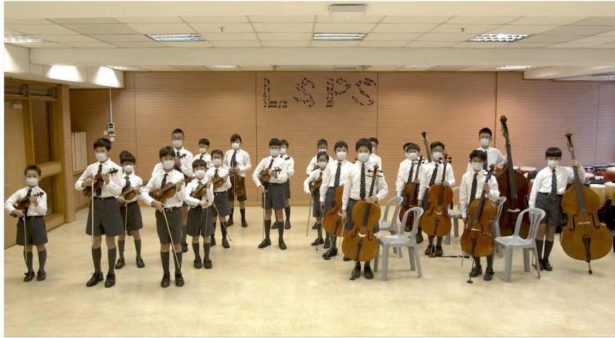
Senior String Orchestra