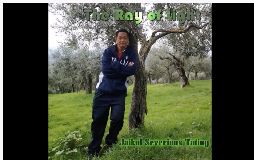
English Version (YouTube)