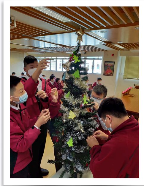
HONG KONG Christmas Wish Tree Activity Chan Sui Ki (La Salle) College