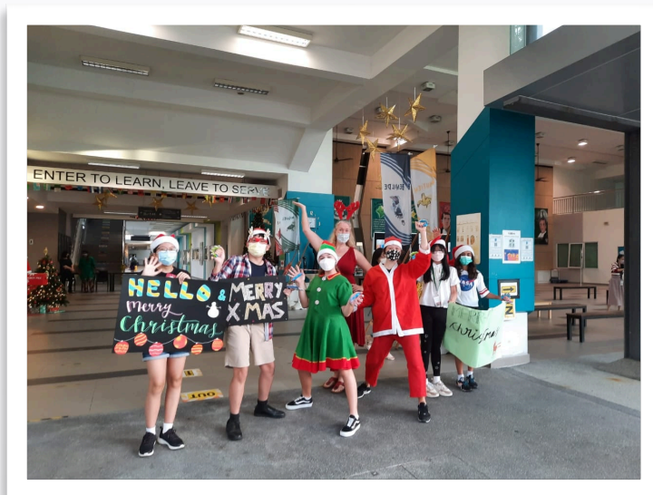
MALAYSIA Project Hello: Christmas Edition St. Joseph's Institution International School Malaysia