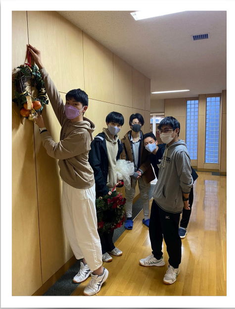
JAPAN Putting Up Christmas Decorations Hakodate La Salle