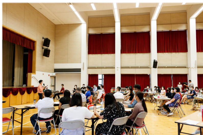
All teachers have a staff meeting to prepare for the new school year.