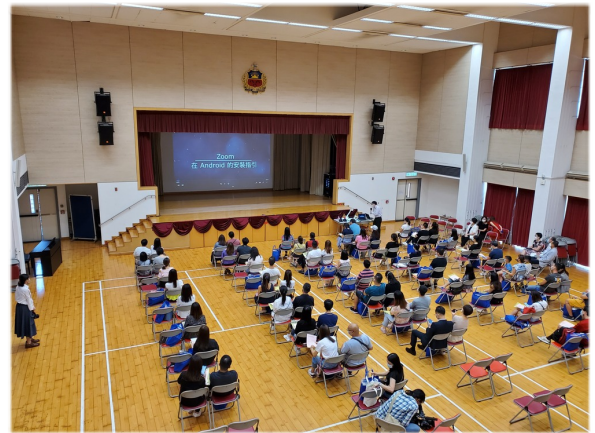
P.1 parents attend the P.1 Parents Seminar.