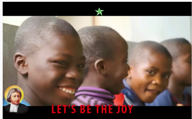
New Light of La Salle