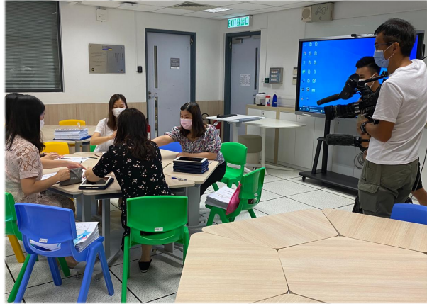
P.1 teachers have a meeting to prepare their zoom lessons.