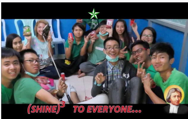
Let Your Light Shine... Lasallians

Click on the images below to view the songs on YouTube.