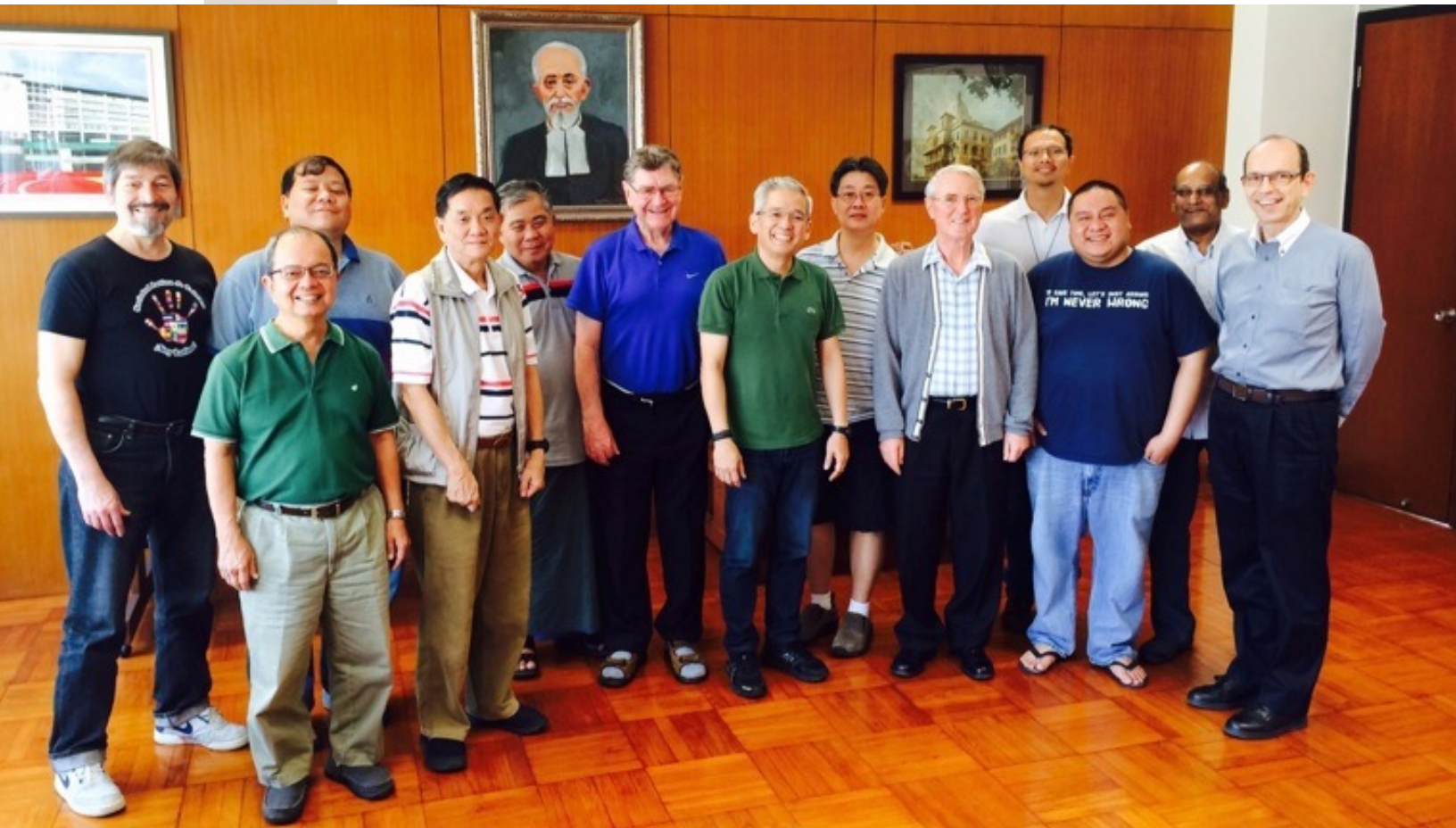
13th LEAD Council Meeting | 12 April 2014 • Hong Kong

- The Lasallian East Asia District Council