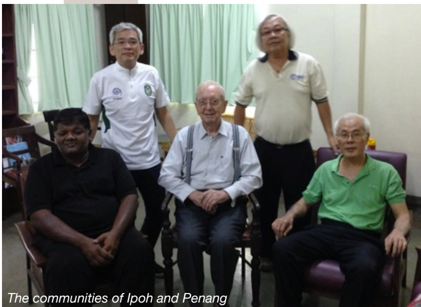
The communities of Ipoh and Penang

mass I met with the Brothers to discuss the impending coming together of the communities of Klang. They are set to be one by December 2014, at the latest.